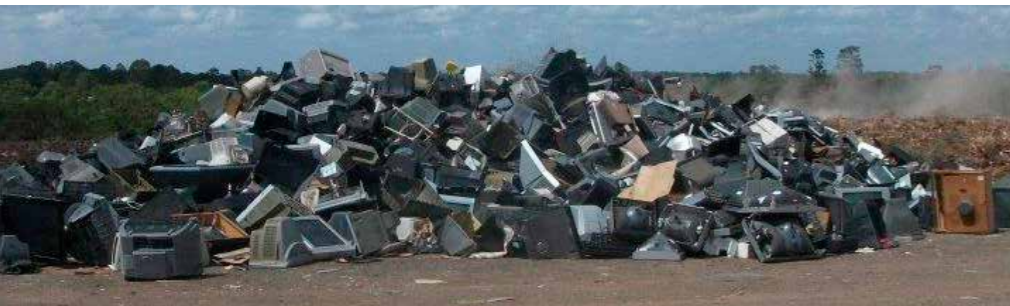
Figure 2: Bundaberg e-waste stockpile, cleared out by DHL weeks prior to the 2013 floods.

DHL's primary focus for collection services was permanent sites which were associated with council waste transfer stations. The rationale for this was based on householder and small business familiarity with disposing of waste at these sites. DHL surmised that it would be beneficial to tap into existing council communication channels to encourage the community to take televisions and computers to the same facilities. As at 30 June 2013 DHL managed 64 permanent collection sites.