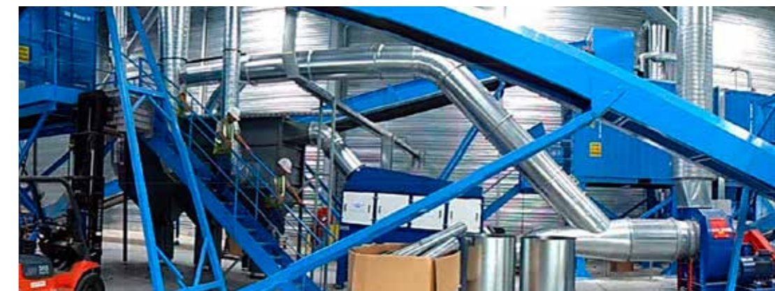
Figure 4: cycleIT CRT processing plant

Table 2 contains details of the types and weights of products recovered from the recycling process in each of the two product classes. This should be reviewed in conjunction with Graph 1 & 2 which highlights what percentages of the materials were recycled in each of the product classes.