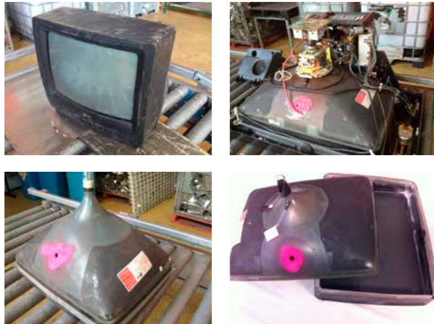
Figure 6: An old CRT television being disassembled at a recycler. All of the plastic is recycled, and the other components are sent for downstream processing. The leaded glass in the CRT must be handled with caution.

DHL's Co-Regulatory Arrangement did not encounter any environmental or occupational health and safety incidents that required notification to any authorities under the relevant laws. Further to this DHL's Co-Regulatory Arrangement did not breach any environmental or occupational health and safety law during the 2012-13 reporting year.