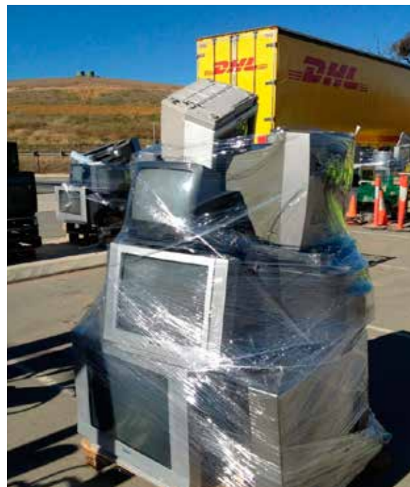
Figure 1: First pallet of end-of-life televisions collected under the Scheme, ready to be sent for recycling (Canberra, 15 May 2012).

The launch of the Scheme's first collection sites, operated by DHL, took place at the Mugga Lane and Mitchell waste transfer facilities in Canberra on 15 May 2012.